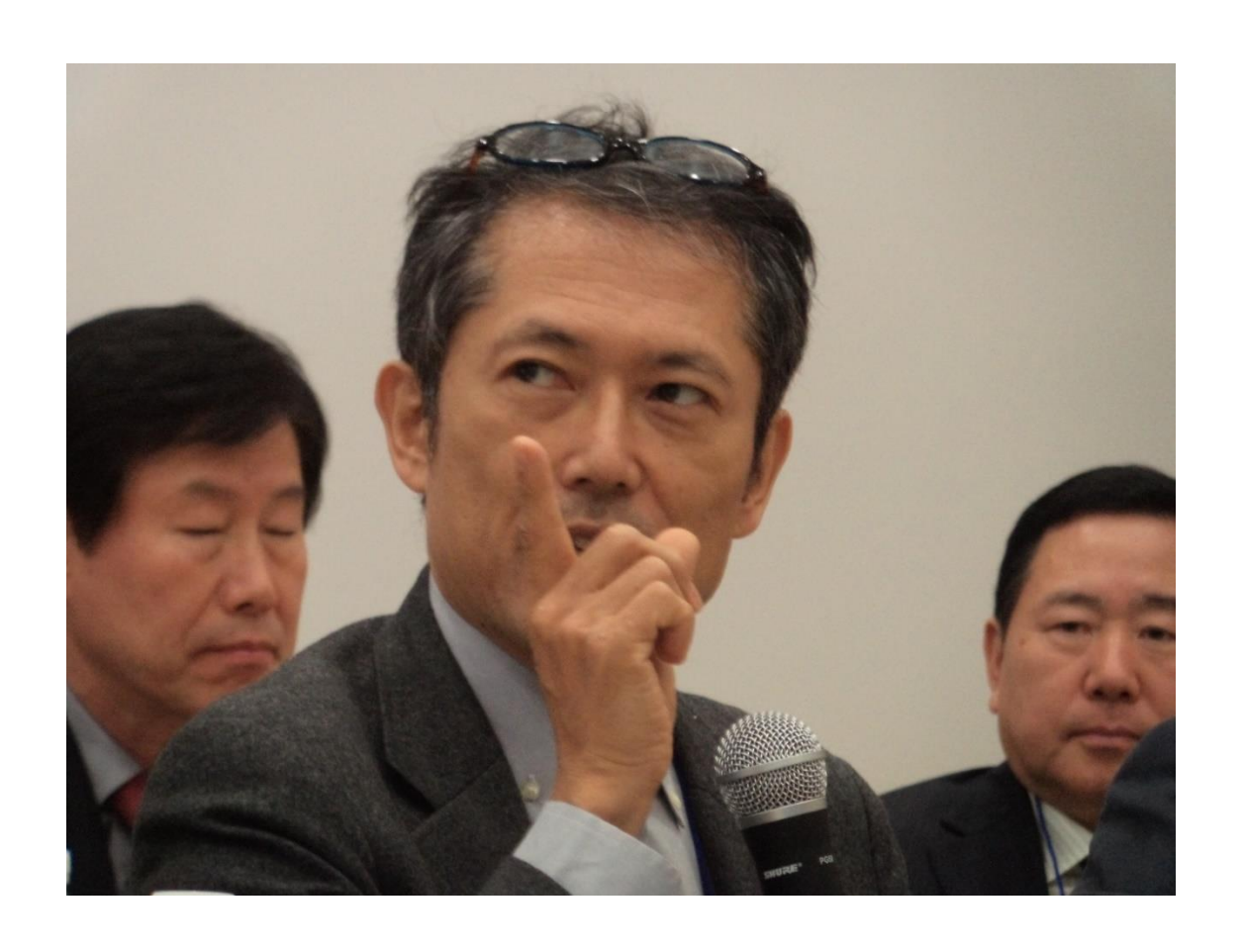
11:10-12:50 Sessions II